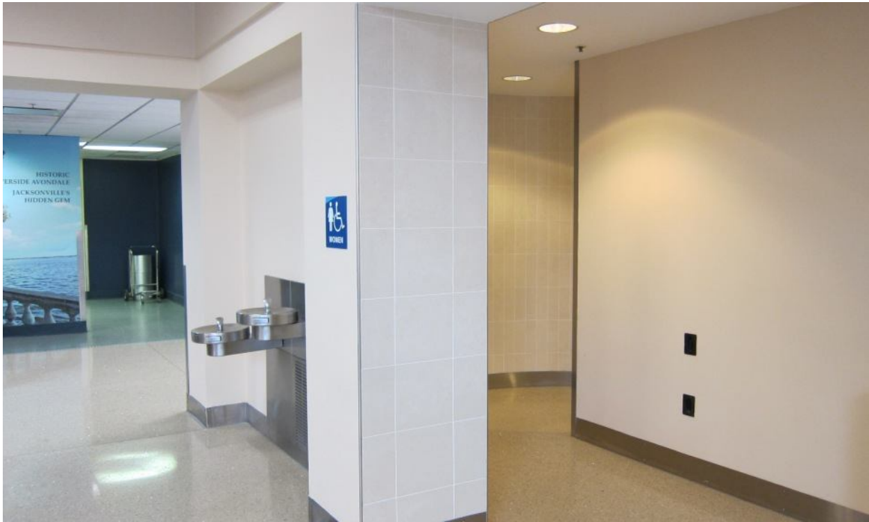
CLOSE-UP VIEW (Black inserts stay – wall receivers for retractable stanchion belts – used to close restroom as necessary)