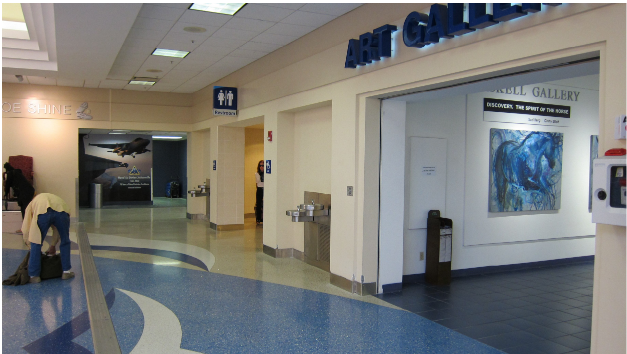
VIEW FROM ART GALLERY